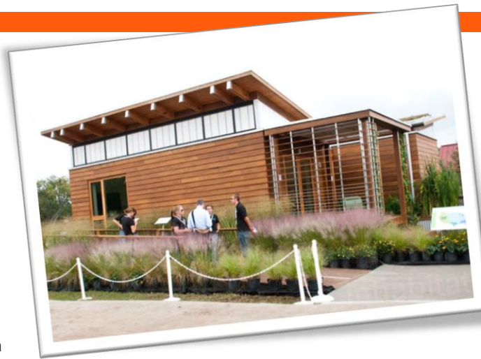
Energy- and water-efficient house designed by researchers at University of Maryland.

Start thinking about what your top state and local issues are and be ready to share at this month's meeting!